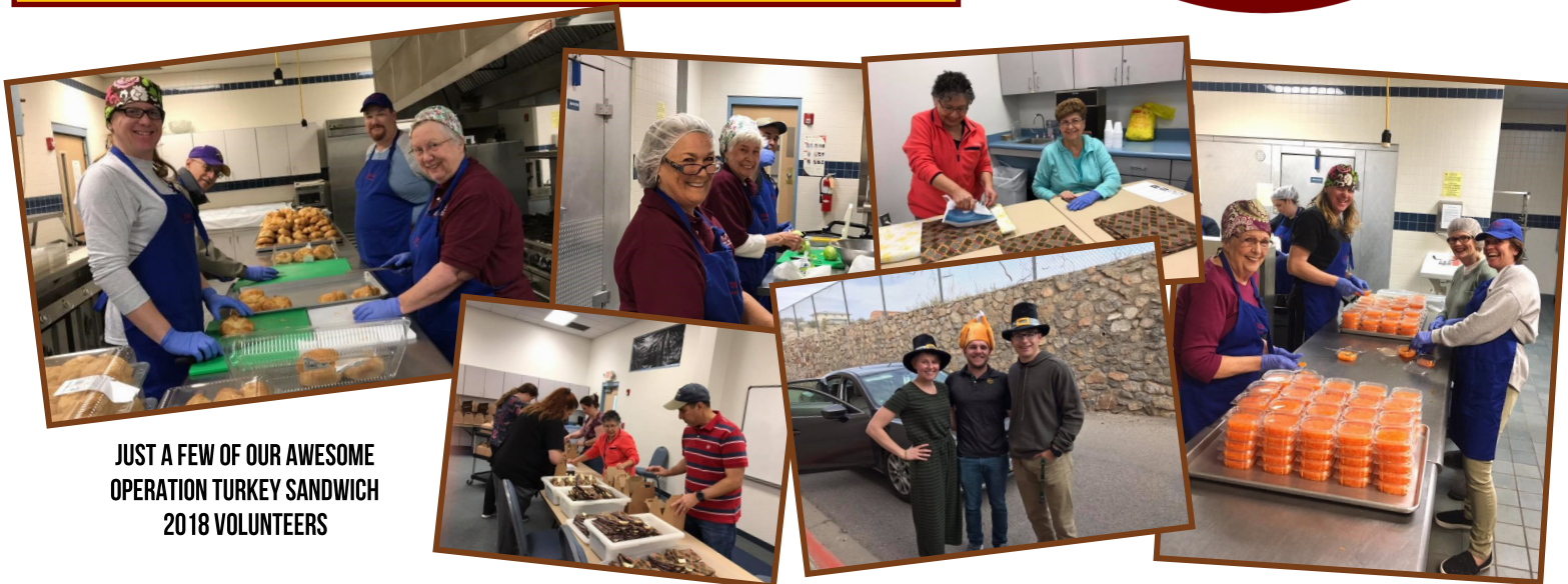
JUST A FEW OF OUR AWESOME OPERATION TURKEY SANDWICH 2018 VOLUNTEERS