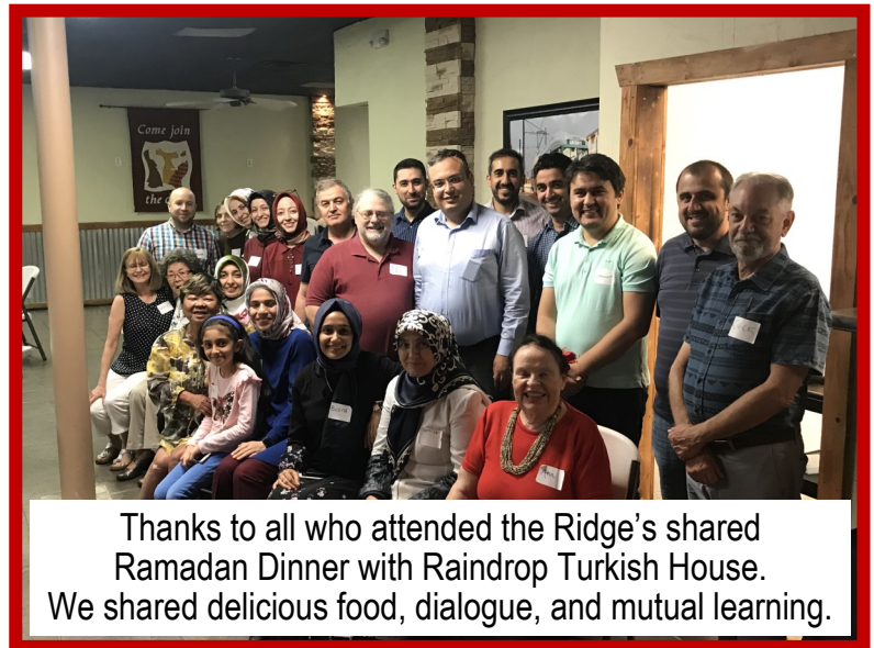
Thanks to all who attended the Ridge's shared Ramadan Dinner with Raindrop Turkish House. We shared delicious food, dialogue, and mutual learning.