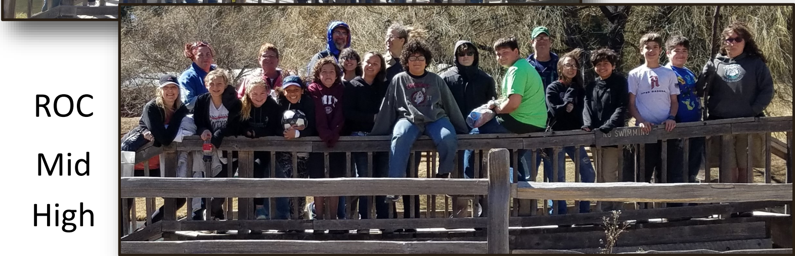
ROC Mid High