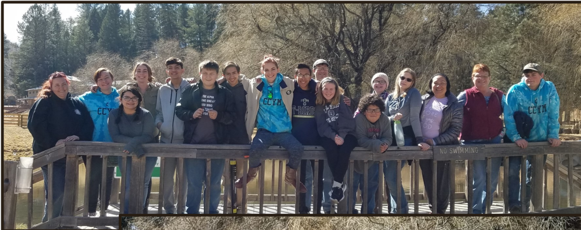
CCYM Sr. High