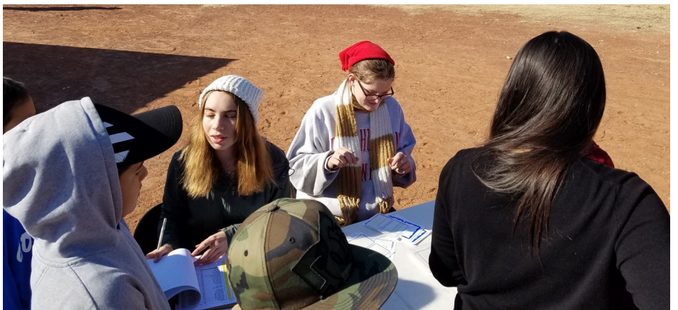
Sidewalk Sunday School