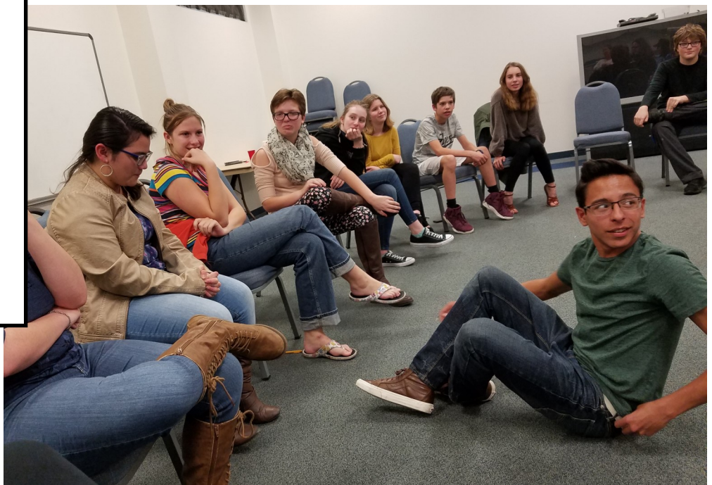
Sunday Night Sillies